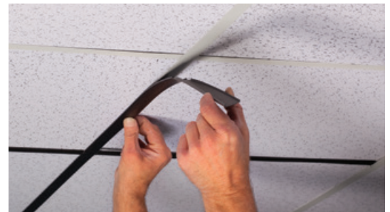
Black GridMAX over white grid