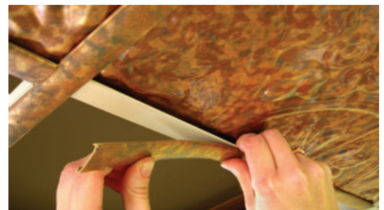
GridMAX in Cracked Copper with matching Fasade panels over white grid