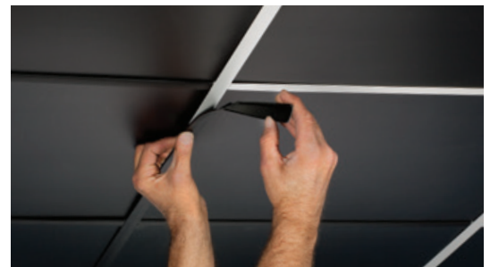
Black GridMAX with Genesis Smooth Pro (Black) over white grid