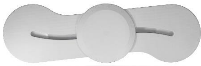
#1100 40" Original Beasy Trans 7.5 lbs.

Premium gliding transfer systems allow you to safely transfer from surface to surface with no-lifting. With our no-lift systems, the weight and friction of the transfer goes on the gliding, rotating seat, not on tender skin or bones. Each board is made of the highest quality nylon based plastic materials that can support up to 400 lbs.