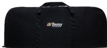
#1220 Carrying Case for BeasyII #1230 with straps