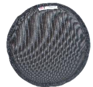
#4300 Standard Cushion #4350 with Velcro