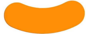
#2600 Beasy Curved 31" x 9.75" x .5"

Transfer boards made of hard material, such as hard wood or plastic, may tend to slide. Using a Beasy No-Slip pad in between surfaces can eliminate sliding, especially on the toilet seat. The No-Slip pad can also keep a patient from sliding before the seat on Beasy premium transfer systems when it is placed between the seat and the patient if they have slippery clothing or wet skin.