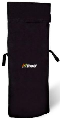
#1520 Deluxe Wheelchair Bag Holds two boards