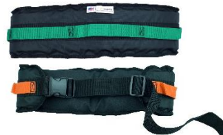
#4200 Large/#4200S Small Beasy Gait Belt