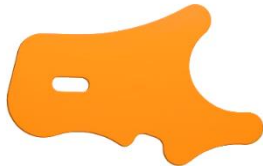
#2100 Specialty Bathroom Board 27.5" x 17" x .5"

In some circumstances, a premium gliding board will not work for a patient. We provide standard transfer boards made of HDPE plastic to fulfill everyone's needs. The weight limit is 500lbs. for our #2100 model and 350 lbs. for our other models. They are easily sanitized with any cleaner safe for plastic. Not shown: #2300 35" Easy Grasp and the #2400 Basic 28".