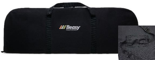
#1120 Carrying Case for Beasy Trans #1125 with straps

Carrying Cases keep your transfer board clean and make them easy to carry. We have standard carrying cases available, or we have an option with adjustable straps to turn your carrying case into a wheelchair bag! Just untuck the straps from the pocket on the back and slip them over the handles on your wheelchair.