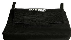
#1430 Wheelchair Accessory Bag