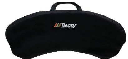
#1320 Carrying Case for Beasy Glyder #1330 with straps