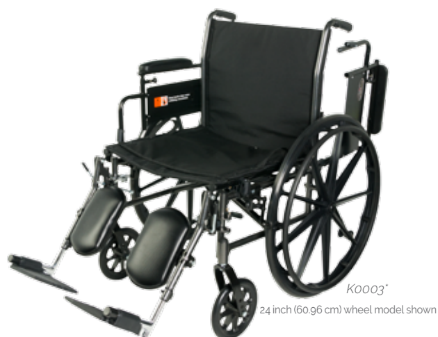
24 inch (60.96 cm) wheel model shown