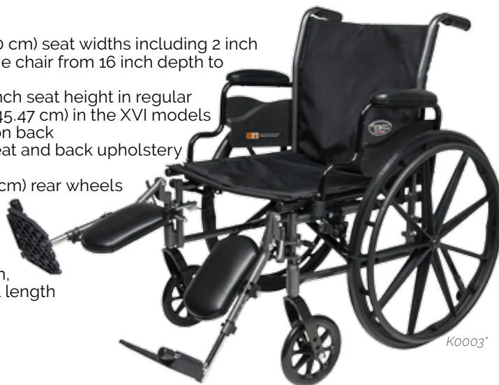
24 inch (60.96 cm) wheel model shown