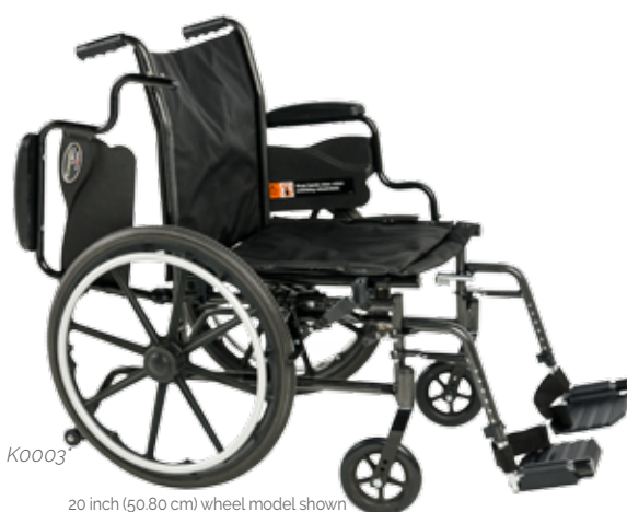
20 inch (50.80 cm) wheel model shown