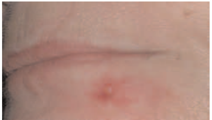
Figure 1b. Wound Area Nearly Healed at 1 Week Follow-Up.